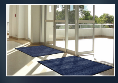
ColorStar<sup>®</sup> (PET fabric features 100% recycled content reclaimed from plastics)

By preventing contaminants from entering a facility, mats will substantially reduce the need for cleaning chemicals that might be harmful to building occupants and the environment. M+A is committed to developing and manufacturing eco-friendly products, reusing and recycling materials as often as possible.