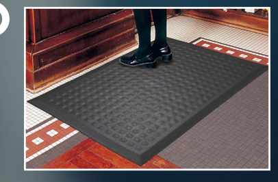
Complete Comfort<sup>™</sup> II

Prolonged standing puts pressure on the feet, leg muscles, spine, neck, and shoulders which can lead to chronic pain, injuries, and muscular disorders. By providing employees with anti-fatigue mats in standing areas, it can increase productivity and reduce the pain associated with standing for long periods of time. Standing on an anti-fatigue mat burns calories, reduces energy consumption, alleviates stress to the back and legs, and also reduces fatigue as a whole.