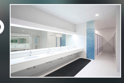
Sure Stride<sup>®</sup> (Adhesive-Back Matting)